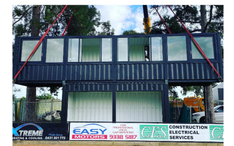
Sporting Club Upgrades