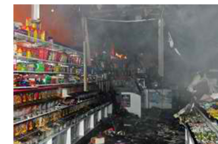
Commercial Shop/Retail Reinstatement