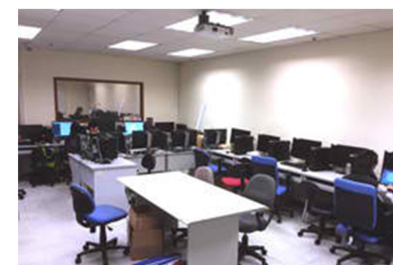
Education Facilities Refurbishments