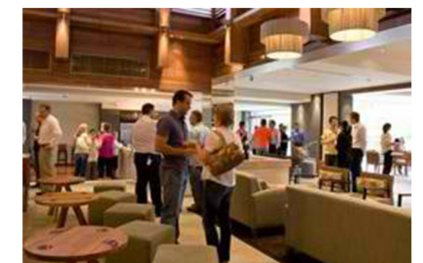
Entertainment Venue Refurbishments